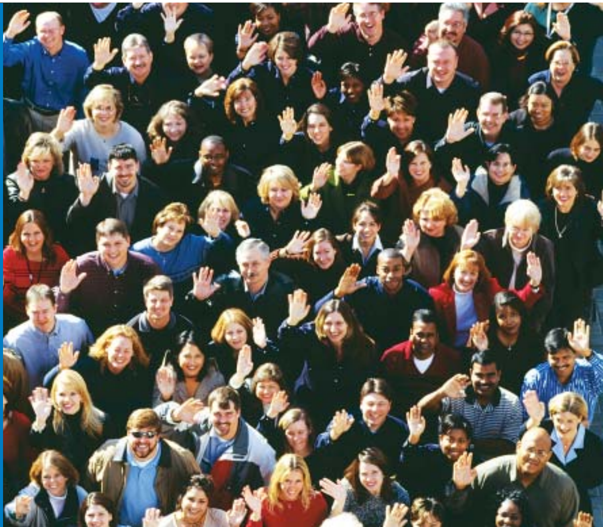
ON THE COVER: 2003 marks a yearlong celebration of 20 years of people, service and technology — TSYS x20.